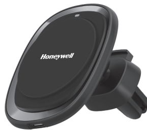
Zest MagSafe Phone Mount Car Charger Platinum Series

Please read the manual carefully before use