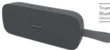
Trueno U300 Bluetooth Speaker Ultimate Series

Please read the manual carefully before use