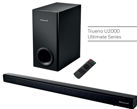
Trueno U2000 Ultimate Series

Please read the manual carefully before use