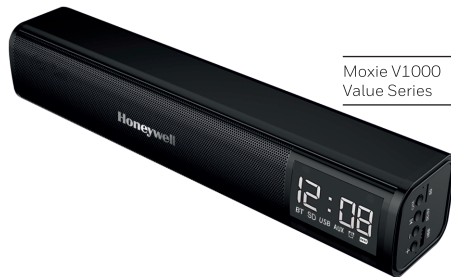
Moxie V1000 Value Series

Please read the manual carefully before use